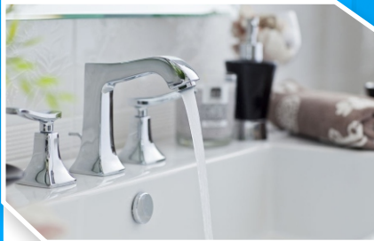
Uninterrupted ( treated) water supply