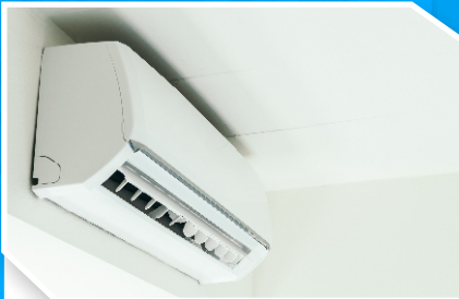
Central air conditioning