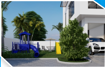
Kids play area & greenery