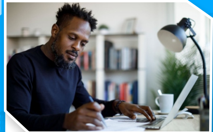
Outdoor office space