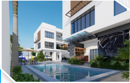
Swimming pool for kids & adults