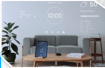
Full smart home features