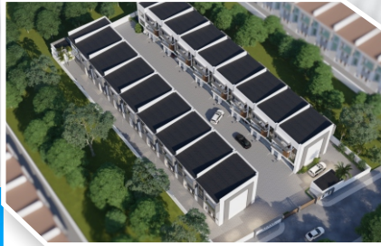
Fast project completion