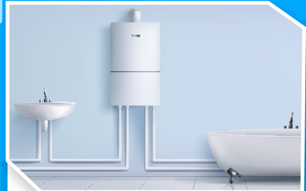
Central water heating