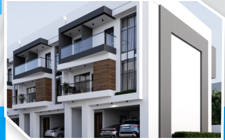
Modern and exquisite