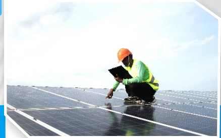
Solar energy solutions